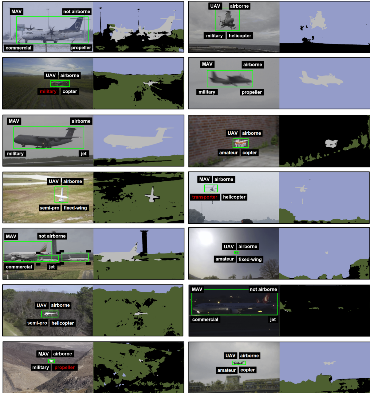
Figure 3. Representative selection of qualitative results including object localization and multiple classification variants (top left: AC_{Coarse2} , top right: MAV_{Air2}/UAV_{Air2} , bottom left: MAV_{Domain3}/UAV_{Domain5} , bottom right: MAV_{Prop3}/UAV_{Prop3} ), as well as preliminary semantic labeling. Correct and incorrect classifications are indicated by white and red font, respectively.